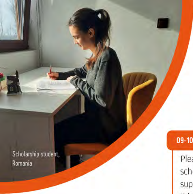
Scholarship student, Romania